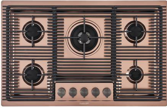
Cooker hob Milanello Copper 5F 7682 008