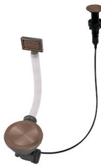
Space Push Copper automatic waste fitting 8407 122