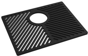
Black grid 8100 652