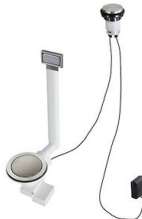
Space Light automatic waste fitting - PL 8407 117