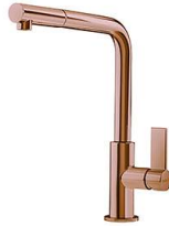
Mixer Tap Omega Plus Copper 8498 858