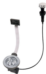
Automatic waste fitting 8407 000